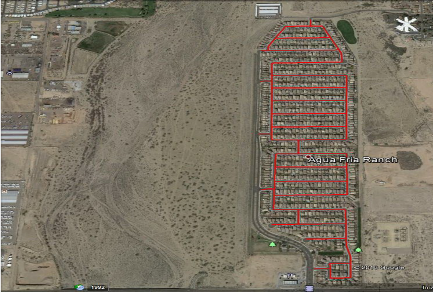
Attachment A., Agua Fria Ranch (photo)